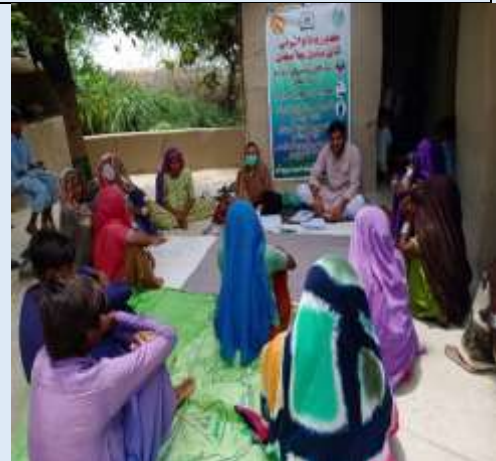
Social Distance session at Jhuddo District Mirpurkhas