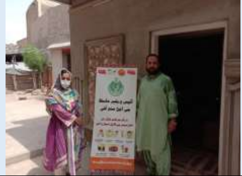
Distribution of SOP'S panaflex to Zakat and Usher Office, Assistant Commissioner East office and Sarim burney Welfare, PMU and OPA's