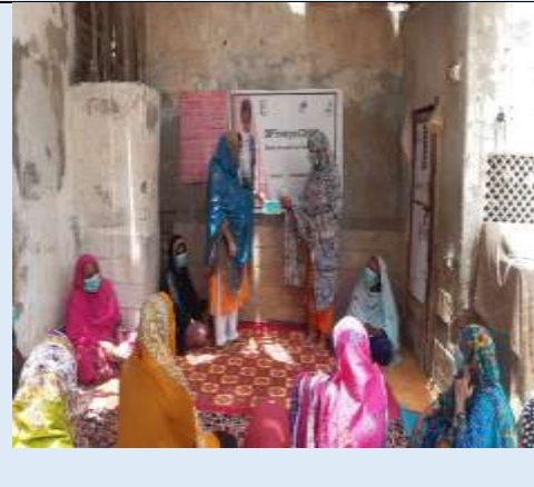
Covid-19 awareness session at VoOAmeen village Ahmed khan kohso Taluka Badin uc haji soomar abaro