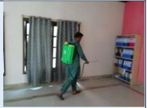
Disinfection Spray at DO MPk office in COVID situation