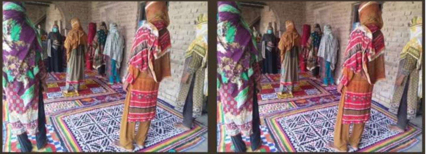
VO Mahi Solangi Distict Naushor Feroz conducted session at Social distancing